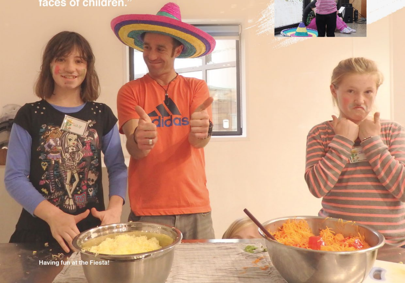
Having fun at the Fiesta!