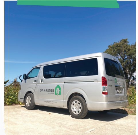
THANKS TO OAKRIDGE HOMES FOR OUR AWESOME NEW VAN!