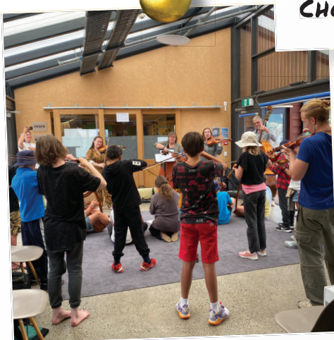
CHRISTCHURCH SYMPHONY ORCHESTRA STRING INSTRUMENTS WORKSHOP