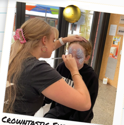
CROWNTASTIC EVENTS FACE PAINTING AT CHOLMONDELEY'S BIRTHDAY PARTY