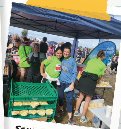
SERVING SAUSAGES AND SMILES AT CITY2SURF