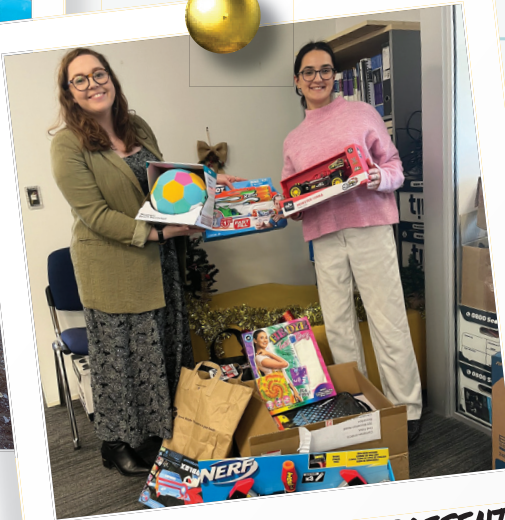
SOME OF THE LOVELY PRESENTS DONATED OVER CHRISTMAS