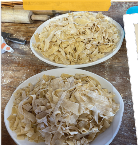
MAKING PASTA FROM SCRATCH!